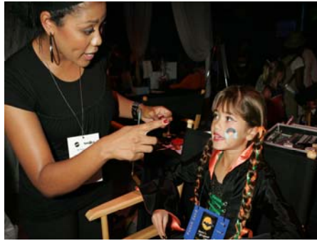
Stage Entertainment, Celebrities on Stage, and One-of-a-Kind Mattel Celebrity Doll