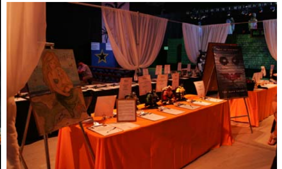
None of this would be possible without the support of our amazing group of Volunteers